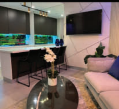
QFirst Invest Westpoint