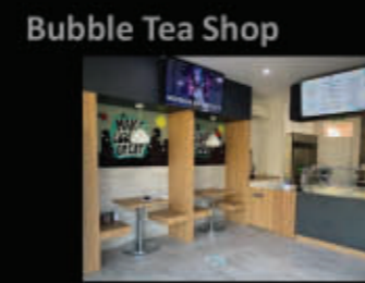
Bubble Tea Shop