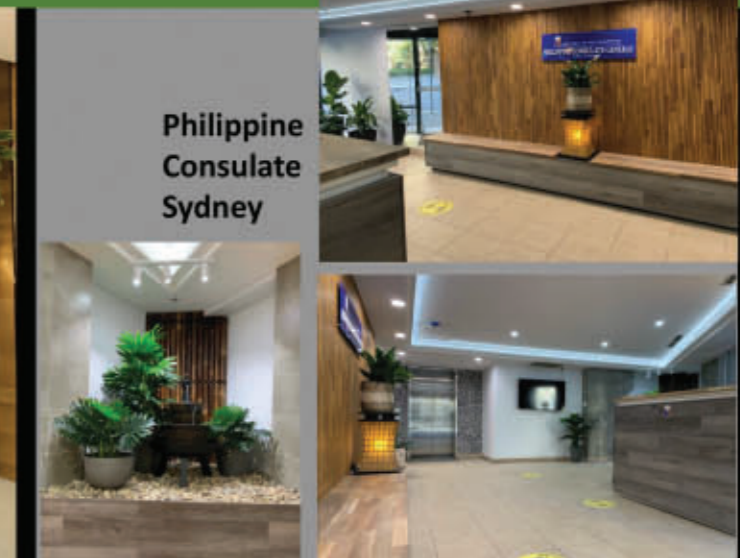
Philippine Consulate Sydney