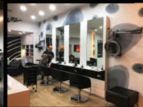
Westfield Parramatta Hairdressing Salon