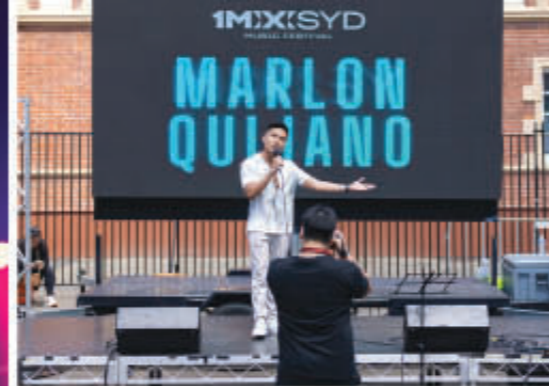
The inaugural 1MX Music Festival in Sydney was a testament to the power of music in transcending borders and celebrating diversity.